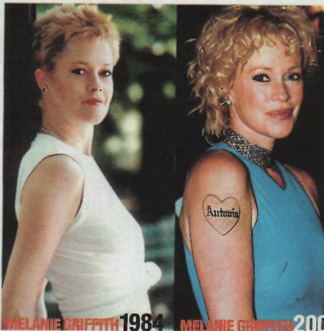
MELANIE GRIFFITH 1984 MELANIE GRIFFITH 2001